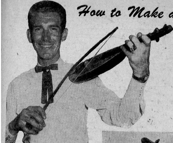
Don Walls, nationally known TV and night club entertainer and member of the "Circle C Boys," puts the Rebec through its paces.